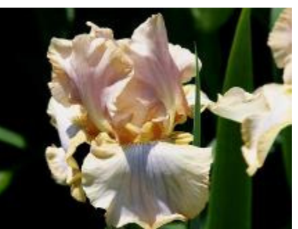
Liquid Amber (G. Spoon, 2003)

of Maymont Park, your Region 4 Reblooming Chairman spent 100 plus hours caring for these plantings. Growing conditions varied at each location. There were however some interesting common denominators. TBs Lunar Whitewash and Northward Ho were consistent performers at all three sites. Likewise, only four varieties out of 52 failed to rebloom at JSRCC. Since the horticulture department faculty there is headed by landscape industry professionals, rebloom's outstanding performance did not go unnoticed.