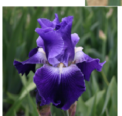
Daughter of Stars (D. Spoon, 2001),