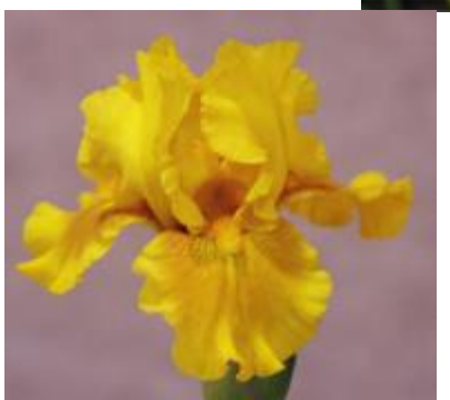
Hot Glow (Tasco, 2006)