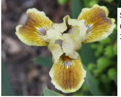
Senorita Frogg (D. Spoon, 2002)